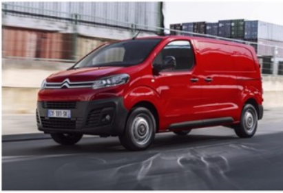
Interrogé par Les Echos, le groupe français a confirmé le lancement d'une vaste offensive électrique dans le domaine de l'utilitaire.

Michaël TORREGROSSA / 15 Oct 2018 / 09 82 commentaires / Utilitaires Électriques